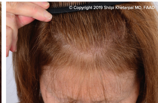
*After 3 PRP Treatments