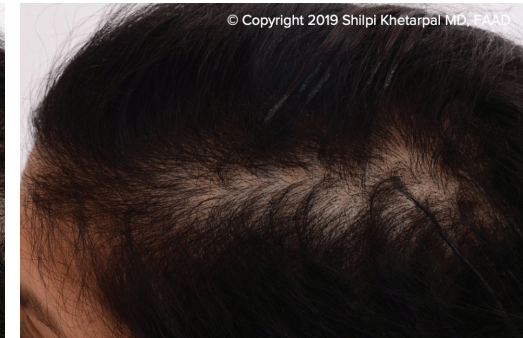
*After 2 PRP Treatments