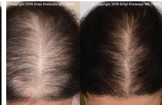
*Before (Left)/After 5 PRP Treatments (Right)